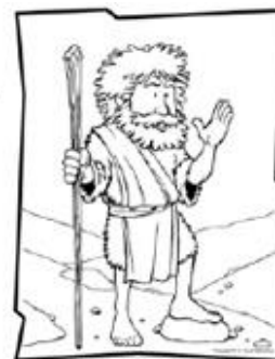
JOHN THE BAPTIST Matthew 3

W L U Z M H V J O J Q V Q S U I Y V S L O G N K M D B H A K K C T X T N M R H K Y T E X X C I X J T E Z Y J T A E S L E P N N Y Y Y A S L P P T R Z T R B M G J W I L D G S U E S Q E D A H D H A I R U X G P T C P Z O P Y O U S C E N U E R F A T O Q T W M O H I N J N A F R Z S G N I L O H L R L T I M E Z J N P O Z C P N E P Y G P E S P O A E A E H M N N Z H C L O R D H E M T A F T Q X T Y J W K K R N J C U Y C T Q T U I X E P F N M H L D Z D E N I