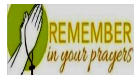
25TH SUNDAY IN ORDINARY TIME