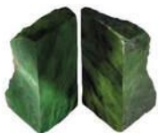
Greenstone Doors Charitable Trust